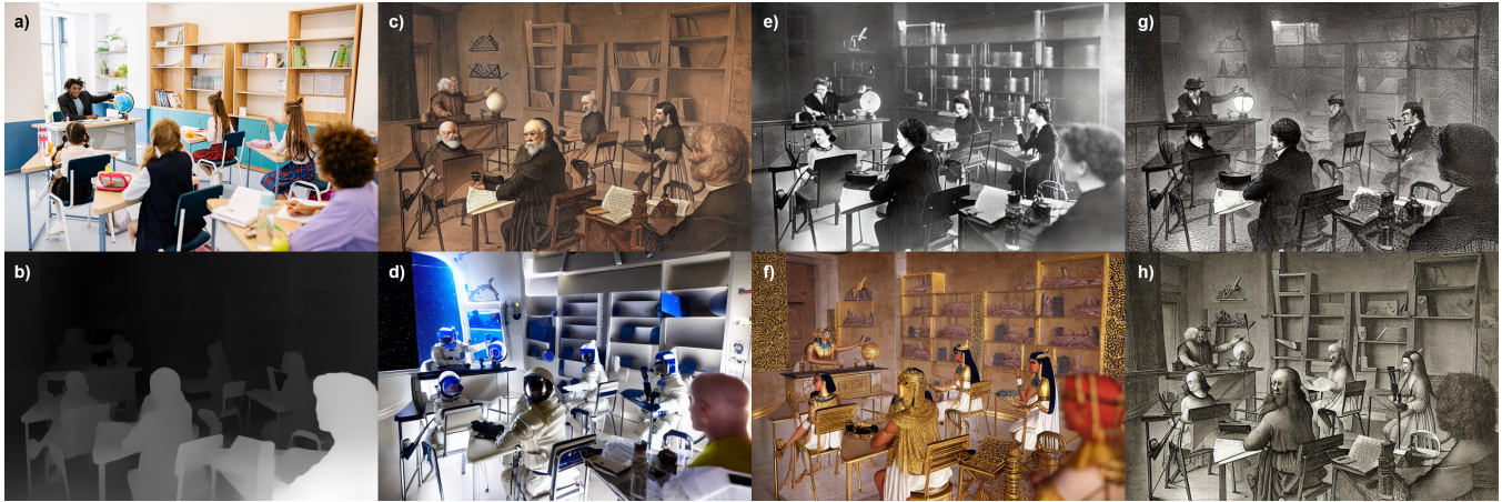
Figure 4: Illustration of role embodiment cases generated from custom prompts using Stable Diffusion and ControlNet . The figure displays the process for each case, starting with the source image (a), followed by a depth map (b), and concluding with target results (c-h) that visually represent different educational personas. These include: (c) Galileo Galilei as a historical figure in the Renaissance, (d) an astronaut in space representing modern STEM, (e) Marie Curie in a 1900s laboratory setting, (f) Cleopatra as a cultural icon in ancient Egypt, (g) Sherlock Holmes as a fictional character in Victorian London, and (h) Leonardo da Vinci as an inventor in a Renaissance workshop. Each generated result emphasizes relevant attire, setting, and details, aligning with educational goals to enhance engagement and understanding through role embodiment.

with the character’s visual identity, attire, and recognizable features. the time specifies the era associated with the persona, which influences stylistic elements, attire, and environmental accuracy ensuring that the details are visually consistent with the period. The place adds specificity to the environment by pinpointing the location where the persona would logically appear, such as a laboratory, an observatory, or a palace. This component influences the spatial composition, guiding the model to include appropriate setting details. Objects include distinctive items associated with the persona, such as a telescope for Galileo or a magnifying glass for Sherlock Holmes. Objects serve as focal points that reinforce the persona’s role and add layers of authenticity, ensuring students recognize the tools or symbols associated with each figure. And the sentiment conveys the emotional tone or atmosphere of the scene, which can range from “exploration” for an astronaut to “mystery” for Sherlock Holmes. Sentiment enhances the engagement by imbuing the scene with an appropriate mood, helping students connect emotionally with the persona and fostering a deeper, empathetic understanding. The generated target results for each case are shown in figure 4. Some samples with a breakdown of the guided prompt structure behind them are provided in table 1, with corresponding resulting prompt full texts provided in the Appendix A.