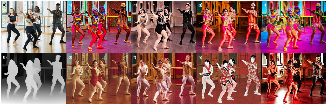
Figure 1: Illustration of various historical dance contexts generated from our structure-guided prompt dialogues for teachers employing Stable Diffusion and ControlNet in a classroom enhanced with an augmented mirror video display. Given a) a camera image snapshot, and b) an inferred depth map, we generate teaching role embodiments interactively (c-j) to realize the students' appearance as c) West African dancers , d) Renaissance court dancers , e) Charleston , f) classical ballet , g) Bharatanatyam , h) Kabuki , i) Samba , and j) Flamenco . The visuals not only capture traditional attire but the environmental settings, offering an immersive representation of each dance form's cultural heritage scenarios enriching the teaching experience.

Kenny Mitchell School of Computing Edinburgh Napier University Edinburgh, Scotland, United Kingdom 3FINERY LTD Lanark, Scotland, United Kingdom k.mitchell2@napier.ac.uk